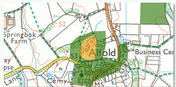
Remains of a Norman ringwork and bailey were discovered during routine archaeological work ahead of development. The newly created County Site of Archaeological Importance (WA223) and Area of High Archaeological Potential (WA224) will ensure that the archaeological implications are taken into account and any future development impact is appropriately managed.

The Building Stones Database for England Map Explorer , a joint initiative between the British Geological Society and Historic England, lets you explore building stones and their sources, as well as the bedrock and superficial geology. You can browse the geological map, as well as search for a building stone, stone source or structure, or search by post-code, address or place name.