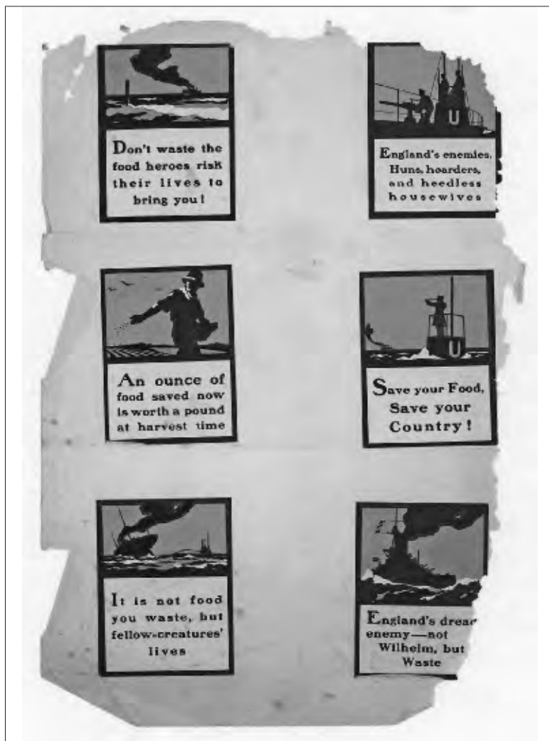
Figure 2 Ministry of Food Control stickers against food waste (SHC ref 9175/1)

Something of the relief that followed peace and the conviction that nothing could be the same again is captured in a 'folk play' written by the Reverend J M C Crum (1872–1959), rector of Farnham, 'On the Home Front', performed by Farnham people in the Church House in January 1920. An additional copy of Crum's script, together with photographs and a programme, have been deposited