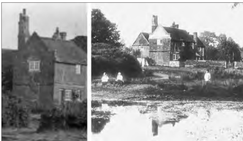
Figure 2 Changes to the buildings. The detail from a c.1904 postcard on the left (Normandy Historians (NH) ref: P121) shows a triangular area of recent brickwork above the Quinta Cottage first-floor window, possibly indicating the position of a former grain hoist. The doorway in the end elevation is bricked up and has been replaced by a door in the near end of the front elevation. The photograph c.1916 on the right (NH ref: P46) shows that the doorway in the front elevation has now been converted to a window, and the gateway into the garden has been moved from the former position adjacent to the house to a new gate some way along the wall. The upper part of the end (west) elevation has been tile-hung. The Normandy Hill Farm farmhouse can be seen to the left and right behind Quinta Cottage.