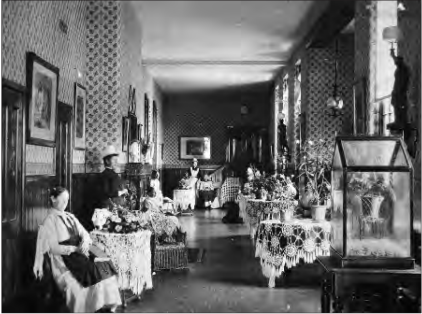
Figure 3 Woman's ward at Brookwood c. 1868.