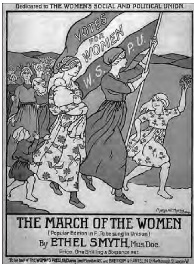
Figure 10 'The March of the Women' by Ethel Smyth (SHC ref 9180)