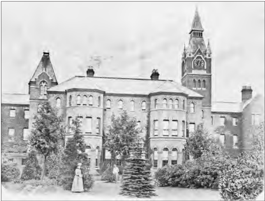
Figure 1 General view of the rear of Brookwood c. 1868 (SHC ref 3043/-)