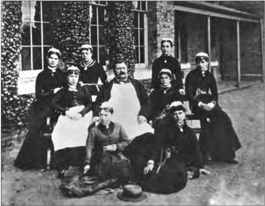
Figure 2 Female attendants at Brookwood c. 1870. Notice the keys hanging from their belts.