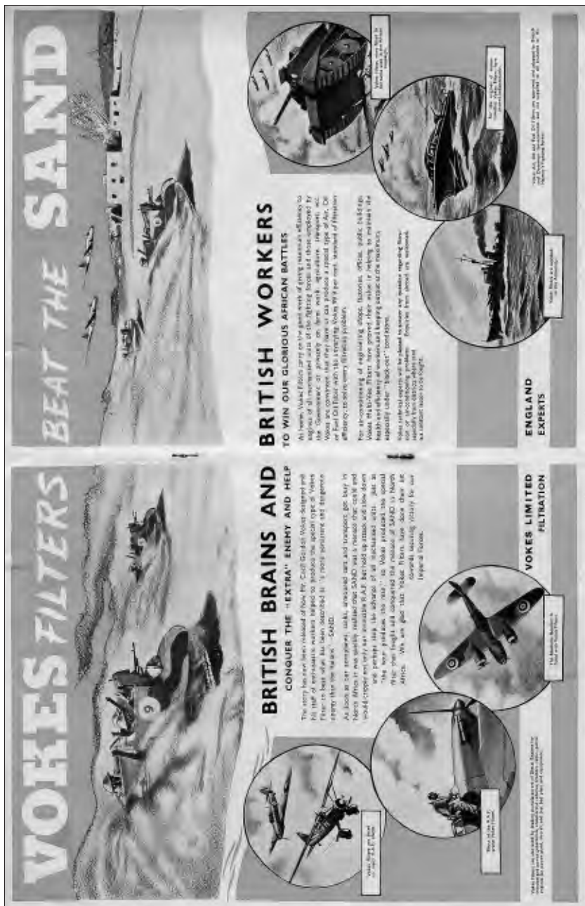
Figure 7 Vokes Ltd brochure celebrating the role played by filters made by the firm in winning World War II (SHC ref 9127/1/6/3)