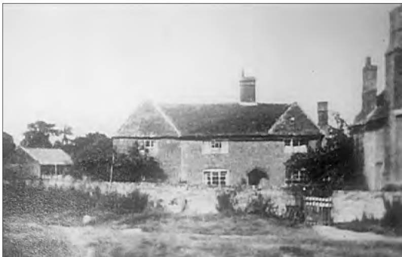
Figure 4 Normandy Hill Farm in the 1920s. The house looks very similar today, but the front gate in line with the front door has been bricked up and replaced with an entrance into the garden from the side. (NH ref: P025.)

Normandy Hill Farm for £500 and The Quinta for £350. This appears to be the first use of the modern names in the deed of sale, although they were still referred to as 'Halsey's cottages' in the electoral registers.