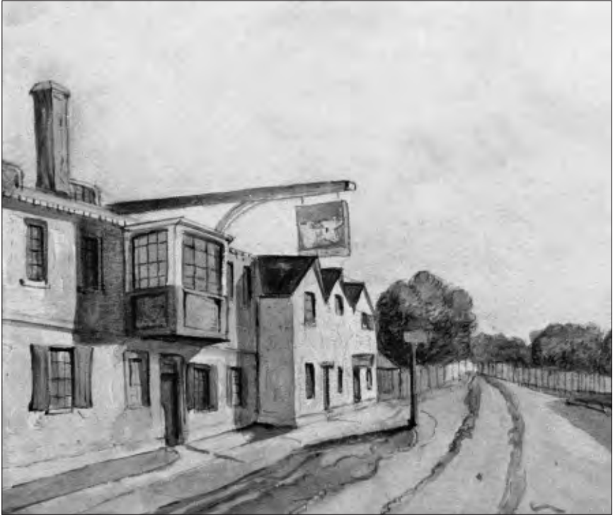
Figure 1 The Bulls Head in a watercolour by F. Tyler Smith after the original by John Hassell, 1825 (SHC ref 6832/6/16/4)

Appearances at Quarter Sessions, like the more solemn trials at the Assizes, were an occasion to set down what was and was not allowed in society – a theatre of justice. The cases which came before the court might be more or less, depending on the incidence of crime, but the need for a public display of justice remained the same. And so magistrates and justices had a rough idea of people who ought to be convicted and punished at each sessions; not too many, and not too few. The system of discretionary justice, in which some but not all verdicts were overturned by carefully measured mercy, kept this expectation in step with the actual number of prosecutions.