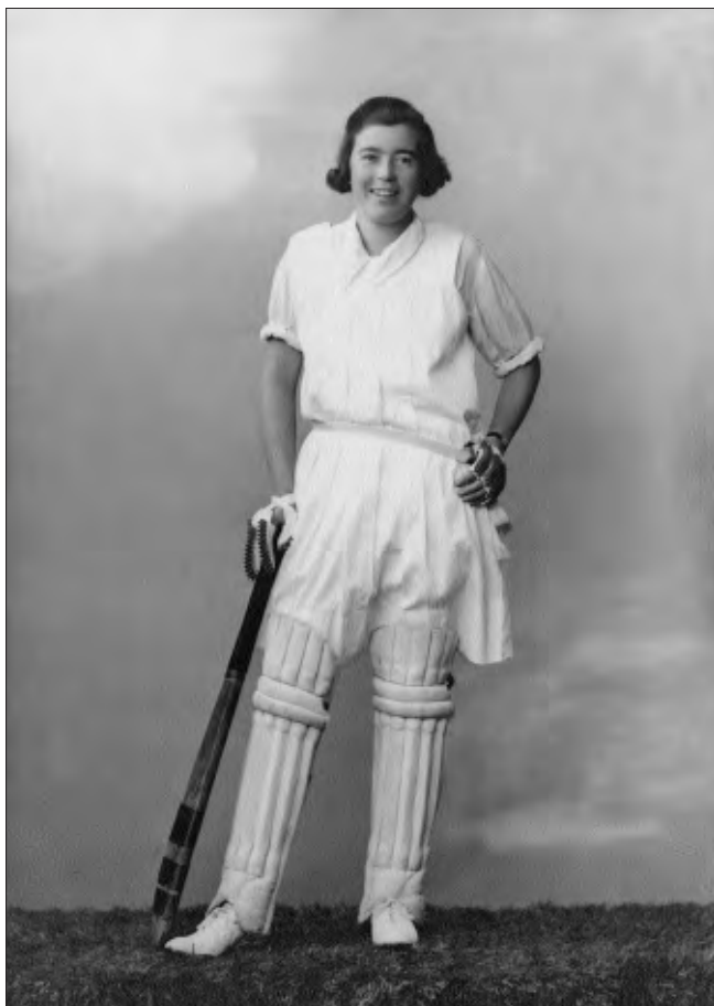
Figure 4 England cricketer, Myrtle Maclagan (SHC ref 9184/4/41)

notebook diaries, 1927–1993, which include some detail of her sporting career (her separate tour diaries are unfortunately not included in this collection). Also included are correspondence and newspaper cuttings relating to her cricketing career, letters written home while on tour to Australia and New Zealand with the England Women’s Cricket Team, 1934–1935; and correspondence and papers relating to her career in the Auxiliary Territorial Service and Women’s Royal Army Corps, 1939–1965.