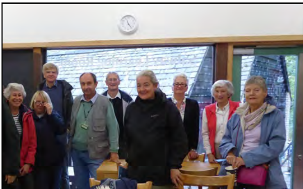
Part of Chedworth group

See http://www.archaeologynationaltrustsw.wordpress.com for the blog on this year's excavation at Chedworth