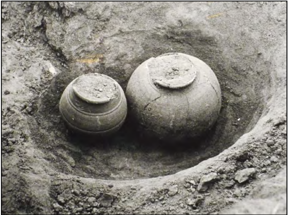
One of the cremation burials as excavated