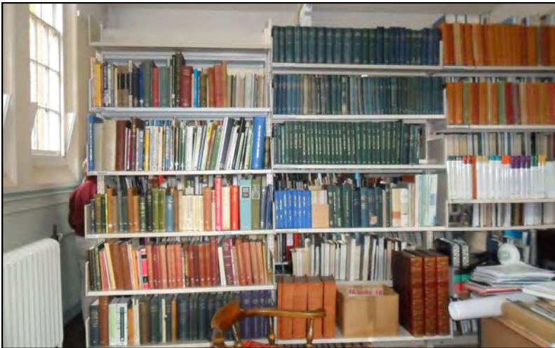
Abinger library and research centre

Material from the Research Room is now lodged with the Surrey History Centre. Journals are not stored at the Abinger Research Centre and will only be accessible on request.