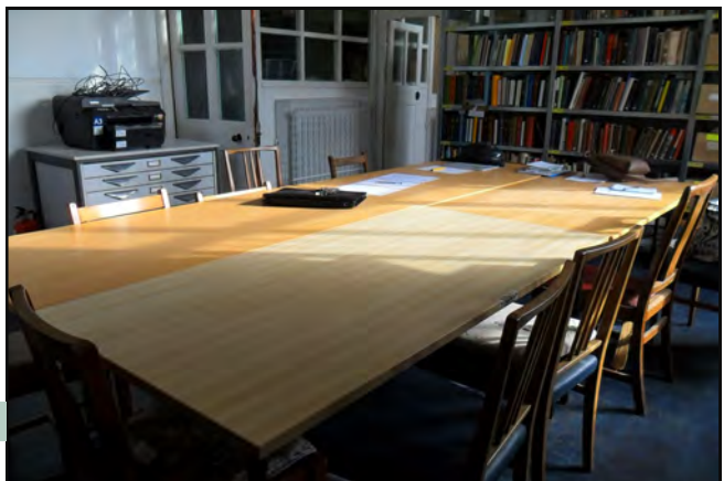
Abinger research work space

Hardy, Thomas Duffus (ed), Rotuli Litterarum Clausarum In Turri Londinensi Asservati (London 1883), 558 ( http://ub-goobi-pr2.ub.uni-greifswald.de/viewer/image/PPN848631250/616/ )