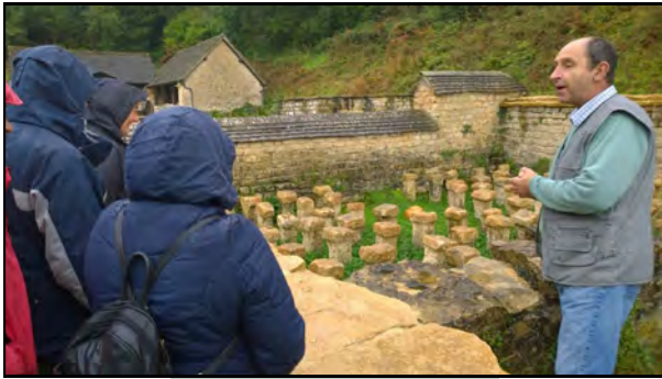
Roger Box and hypocaust system