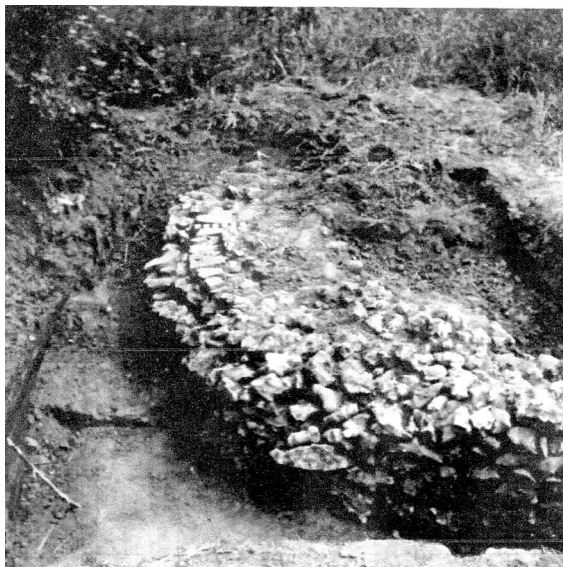
Curved flint feature in Trench II of 1971 evaluation looking from northwest to southeast.

foundation or wall platform of large packed flints; this was 11ft in diameter and by digging down the outside of it was found to be 2ft in depth, founded on sand (although whether this was redeposited from elsewhere or was the natural surface was not established by the excavation). Mr Moreton noted the presence of many fragments of handmade roof tile in these shallow trenches.