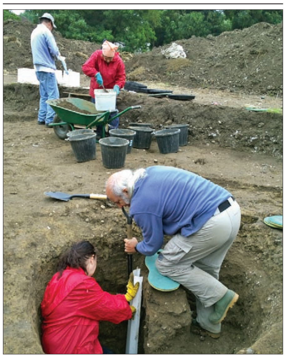
CHURCH MEADOW, EWELL 2014: Environmental sampling