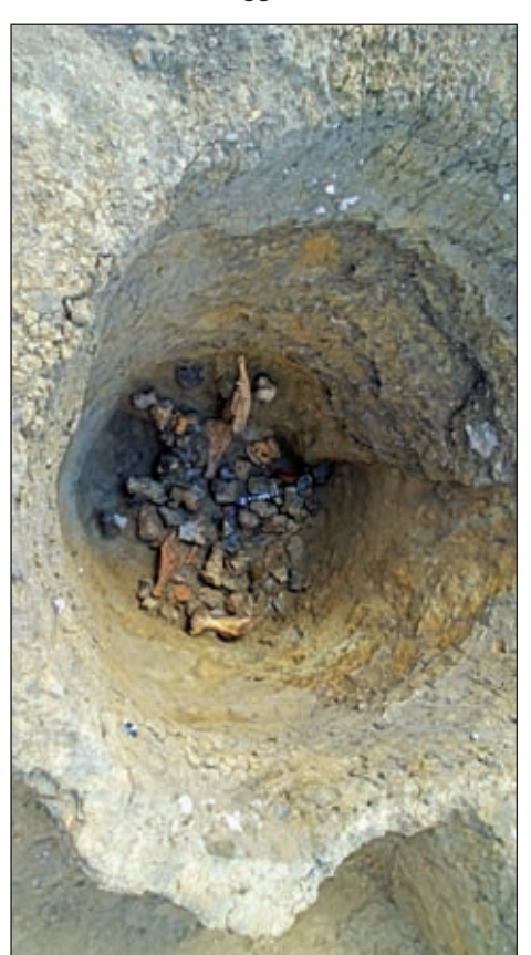
Ritual pit 241 with flint and bone deposits beneath clay lining.

Between the 'non-agger' and the eastern roadside ditch were areas of closely packed