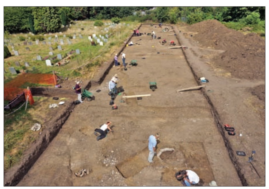
Church Meadow, Ewell 2014: Area J in foreground.

At the end of the 2013 excavation a small gully was noted to the west of the deep pit in Area J. Further investigation revealed a ditch of probable 1st century date, shallow and wide in profile, running across the trench in a north-east/south-west direction, roughly in line with the anticipated route of Stane Street across the site. This ditch