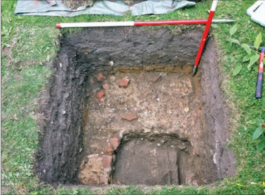
Test pit 2 in the garden of Willmer House (Museum of Farnham), West Street, exposing probable Georgian floor of unknown ancillary building

pottery at the Library and Memorial Hall along West Street, attesting to the ribbon development westward during this period known from former rescue excavations in the Willmer House (Museum of Farnham) gardens (Graham and Graham 1997). Most finds, however, are of post-medieval and Victorian material, whether through its location outside of the medieval core or restrictions of excavation.