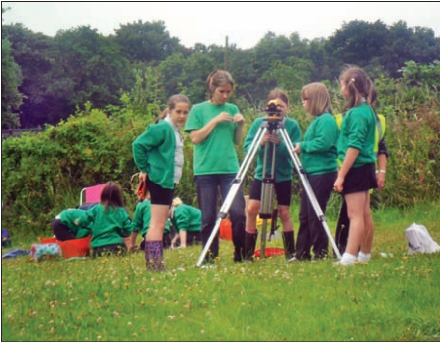
School children excavating and taking levels at the West Street allotments/cemetery site