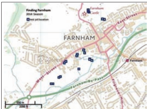
Map of Farnham with location of 2014 test pits