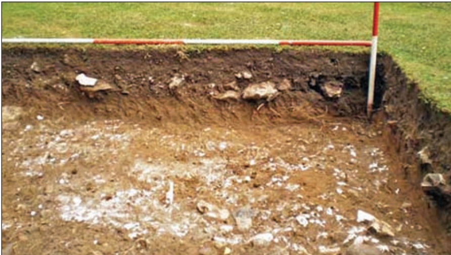
Chalk scatter under flints

The flint surface did not extend to the eastern corner of the trench where a chalk surface was uncovered beneath large flints. Medieval pottery sherds were found in this area.