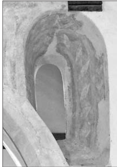
The same painting today