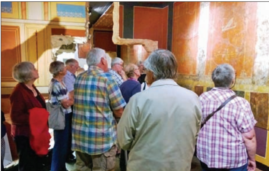
Members of the Group examining a painted wall in the Museum

Within the town, we saw the London Gate and the deep defensive fosse with some upstanding wall but the only other constructional remains to be seen are a very fine mosaic pavement and hypocaust within a large townhouse.