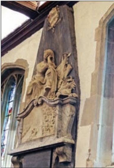
The Geary monument

We do not know when the floor of the south aisle was brought down to that of the north aisle but it had been done when A Heales wrote his description of the church in 1871 5 . The plinths were encased in cement during Butterfield's work on the church in 1885 6 .