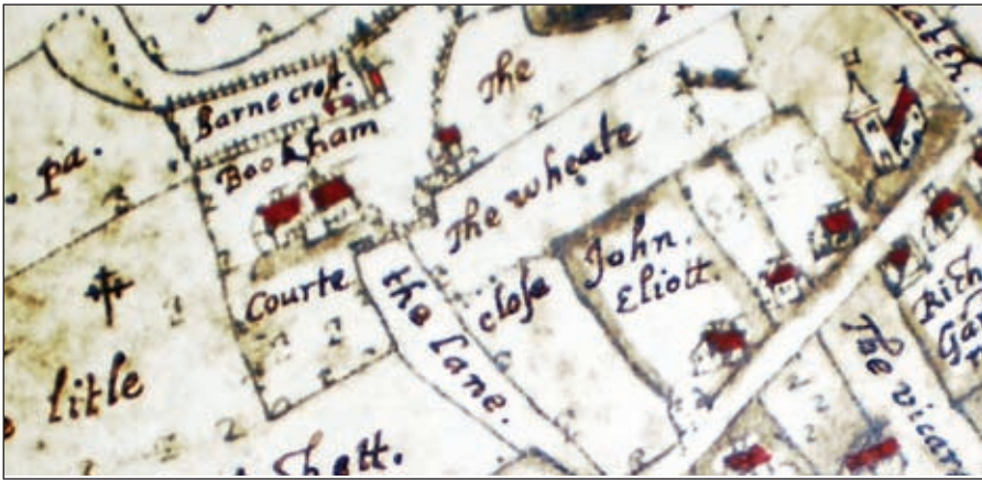
Part of Clay's map of 1614 showing Bookham Courte

The excavation uncovered a flint cobbled surface extending over most of the trench at a depth of 30-40cm. A considerable amount of medieval roof tile was recovered from the soil above this surface. In the south-west corner of the trench two areas of flint surface of different construction separated by a long shallow depression or gully, included one of pea gravel over flints and the other of slightly larger flints and no pea gravel. The gully between the two was cleaned but no finds were recorded. It is probable that these areas reflect make-up of the surface at different times. A 2.5m x 0.3m section dug through these two areas of flint and the gully revealed chalk blocks at one end and large flints at the other at a depth of c20cm below the cobbled surface. A horseshoe was embedded in the soil between the chalk blocks and the gully.