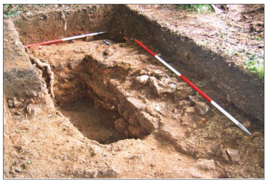
View of the wall join in Trench 14. Nearer the camera the more regular stonework of the later building wall can be seen cut into the pre-existing structure.

but turned to the south at a point where it had been cut into an earlier structure which was at a slightly different alignment, and is probably part of an earlier building. The later range's corner had been bonded into the wall of this earlier structure not far to the south of the latter's outside north-east corner, and the return wall of the earlier building was traced along the trench to the west to a point where it had been largely robbed out. There was some evidence suggesting that there had been rooms to the south but no cross walls could be located; a large amount of tile rubble with a high proportion of box tile fragments hinted at the former existence of heated rooms in the area. The wall's foundations had been stepped down the slope, so if the same roof and floor line was maintained, the rooms at the lower end would have been considerably above outside ground level. At each end of the trench parts of the 1990s excavation trenches were located, a valuable aid to overall surveying. This trench was supervised by Nikki Cowlard.