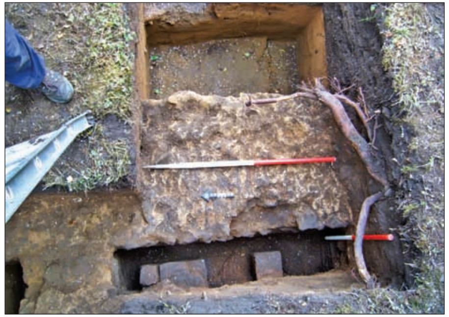
West end of trench 13; horizontal scale pole on main north-south wall, with pilae of heated room in the foreground and east-west return wall to the left.

To the south, trench 16 located another part of a heated room, this time almost completely robbed out right down to the well-preserved sub floor, on which traces of pila positions could be seen, with just one tile still in situ. On both east and west sides of the trench traces of walls were found positioned in a way that suggested there may have been an apse to the south, a theory also supported by irregularities in the pila positions. It is likely that this was a second room rather than a continuation of the