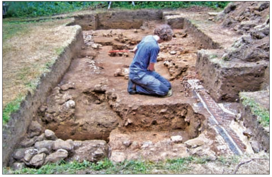
Trench 15 from the east; the figure is on the line of the robber trench of the main wall. A surviving part of the foundations can be seen in the foreground. To the right, part of the mosaic and beyond that the remnants of other floors.

Trench 15, under the supervision of Emma Corke, examined the area of the possible corridor to the west of the later, probably 4th century, range of rooms found in the 1990s. Much of the area along and on both sides of the main south wall had been robbed out to near the base of its foundation. No evidence was found for walls crossing the supposed corridor to match one found last year and therefore a corridor as such is confirmed, perhaps set between two end wing rooms. In one area a small portion of the opus signinum corridor floor survived, set on mortar over sand. It was possible to find and record evidence for two further north-south cross walls to the north of the main wall providing evidence for more rooms. Some information was also gained about their associated tessellated floors, which were slightly stepped up one after the other along the sloping ground from west to east. A small area of the mosaic found in the 1990s was exposed with a fresh piece alongside to provide a comparison in order to test how well it had survived reburial. It was found to be in good condition. Valuable information was recovered about the nature of the foundations of the main wall and the outer corridor wall.