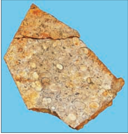
Purbeck Marble fragments (approximately 185 x 120mm); the straight line to the left has a rounded edge.

To the south, trench 16 located another part of a heated room, this time almost completely robbed out right down to the well-preserved sub floor, on which traces of pila positions could be seen, with just one tile still in situ. On both east and west sides of the trench traces of walls were found positioned in a way that suggested there may have been an apse to the south, a theory also supported by irregularities in the pila positions. It is likely that this was a second room rather than a continuation of the