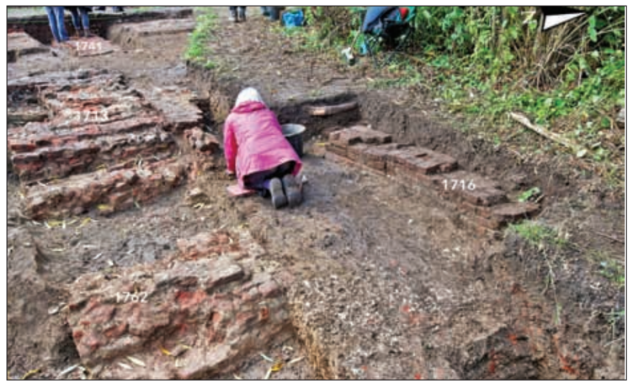
View of phase 3A contexts in trench 17, with the moat and brick jetty elements 1762 and 1716 in the foreground, and the north-east corner of the watergate (1713) centre left. At the rear is the foundation of the phase 3B gallery wall, 1741.

In the late 15th century a substantial rectangular brick building was created, after first stabilising the ground with massive amounts of flint rubble. It may have been well