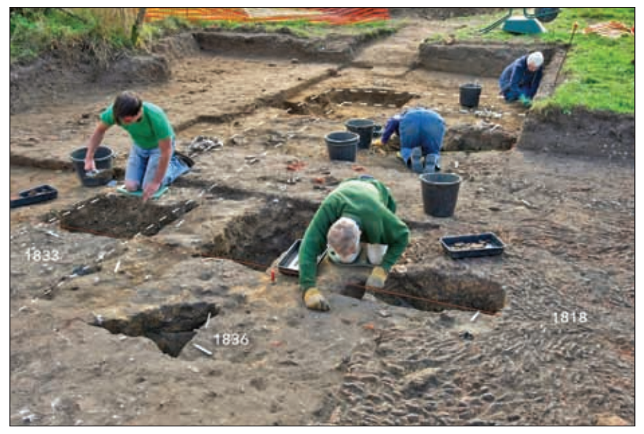
View of trench 18 showing the phase 2A hearth (1818 to right) with various phase 2B features under excavation within the robbed out kitchen wall 1833.

The new hearths were very distinctive, including a very blackened rectangular hearth likely to have been used for spit roasting, with next to it the base of a large oven. The