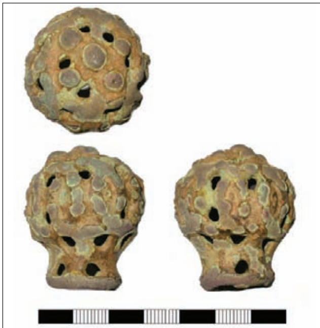
Hollow openwork spherical 'staff head', cAD1050-1150.

Other notable medieval finds include five French jettons, part of a prick spur (45A758), the arm from a late medieval crucifix (20ACB6), an unusual strap distributor (2AB111), and three harness pendants. One of the latter (F42731), from Hamwell Fields, is a fine large gilded example of 12th century date. This has an over-mounted dragon set vertically and presently has no parallel. (The other two pendants are 8E6372 and F43165).