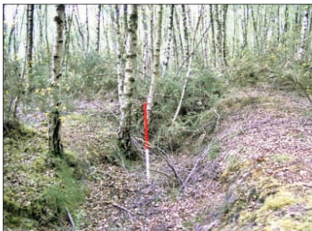
Ash Vale: eastern run