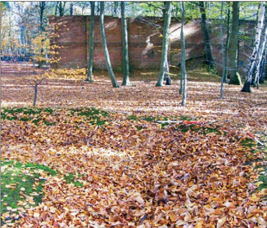
Claycart: Eastern end of firing range with trench section in foreground

Features adjacent to Claycart Road consist of a machine gun range of two brick-walled sections with surrounding earthworks. The feature at the western end of the range is constructed with bricks from a company that ceased trading in 1930, and map regression work also confirms this pre-1930 date. The brick feature towards the eastern end of the range is of slightly different design, as its supporting buttresses are narrower and it is reinforced with iron sheeting approximately 12.5mm thick (half an inch) on the areas receiving the shots. The layout indicates that the two are associated, but the differences in construction suggest one was a later addition. The eastern feature contains graffiti dated 1941, suggesting that the range was constructed just prior to 1930, but continued to be used and developed until fallen into disuse to become a graffiti canvas by WW2.