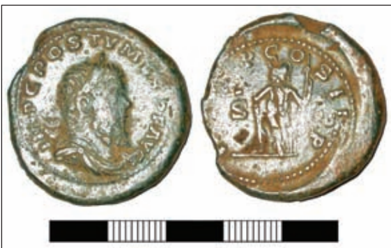
Sestertius of Postumus, AD260, Reverse type: Emperor standing holding spear and globe P M TR P COS II P P S C. Double struck reverse.

Of 22 medieval coins from the survey, the earliest, from Hamwell Fields, is a penny of the poorly struck 'Tealby' coinage of Henry II minted 1158-80 (2FA264). There are also seven coins of the Short and Long Cross coinages of 1180-1279, and others of note include a cut halfpenny of William I of Scotland, minted c1195-1230 (DBC5E6), from Downside, (these are frequent finds in southern England), and a coin of Enrique of Castile, 1369-79 (AE47E2) from Hamwell Fields. Eight of the 22 came from Cobham Park or Downside.