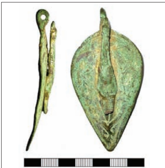
Shield-shaped harness pendant with over-mounted 'dragon', gilded and with additional engraved details. 12th century.