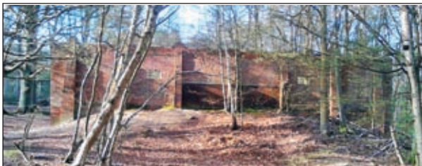
Potters machine gun range

This feature is not far from Potters International Hotel, the previous site of the Aldershot Officers Club. Map regression places this as being a machine gun range dating to around 1930, and its design and construction are similar to that at Claycart. It consists of a single brick section of walling with earthworks to either side. Just east of the brickwork is a rectangular concrete base remnant of a building, and although there is no direct evidence to conclude that it is related, its close proximity suggests it could be. A shell casing dating to 1944 was found in the earthworks associated with the range, suggesting, unlike the similar machine gun range at Claycart, that it had remained in use well into WW2.