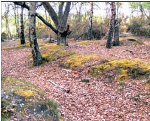
Ash Vale: western run

The more westerly of the two sets runs for 38m along a bearing of 20° centered on SU 8959 5367 in a rough zig-zag pattern. It is quite shallow, ranging from 0.5 to 1m in depth, and varying in width from 2 to 2.5m.