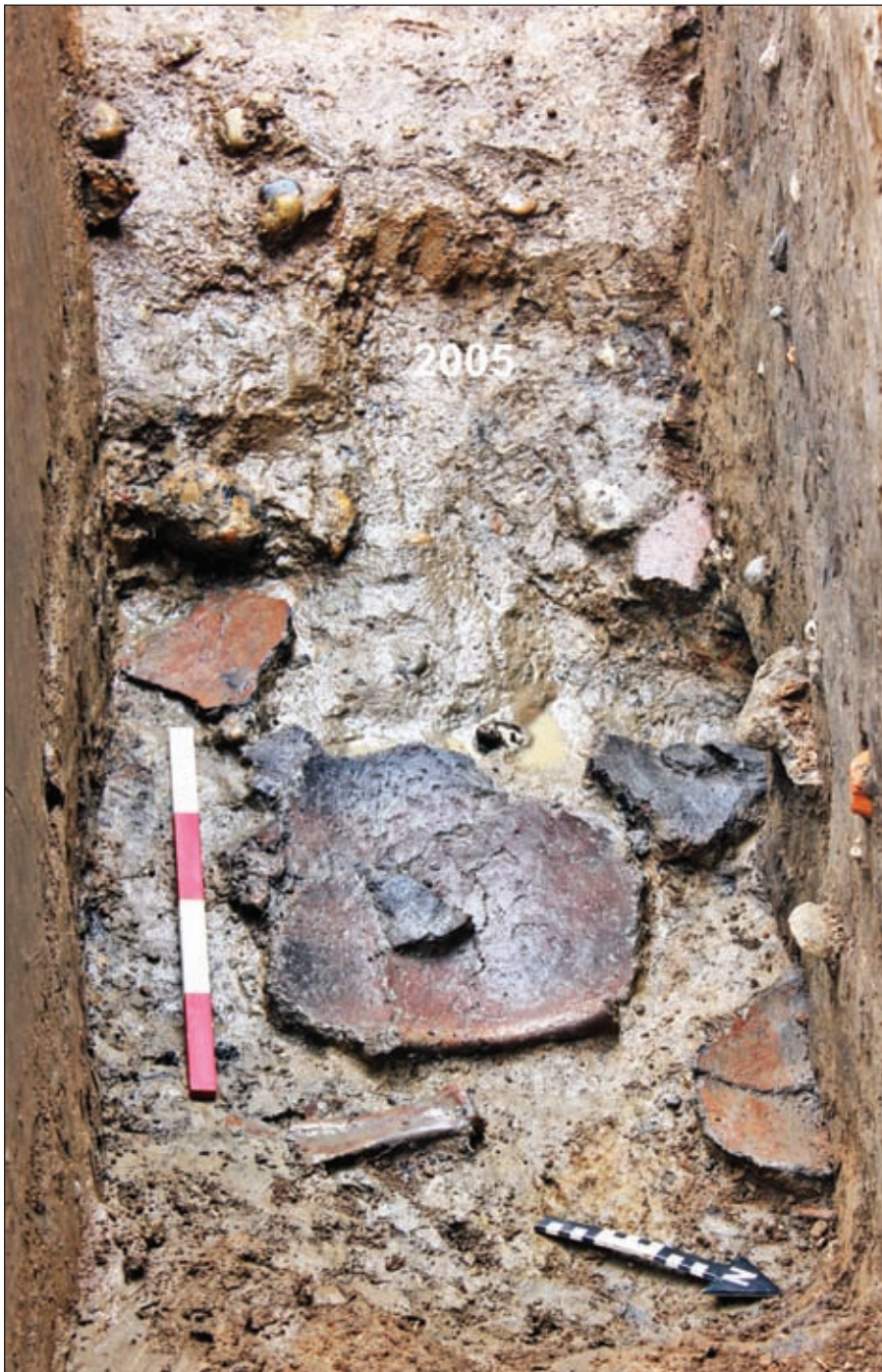
Earthwork section: base of the U-shaped ditch recut with pottery in situ. [T20 pottery].