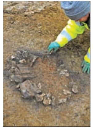
Early Roman hearth being excavated.

The main phase of excavation took place between September and December 2009, when two areas (B and C) were investigated, along with a further area (X), which linked the two sites. The excavation in area B showed Late Iron Age through to early Roman period settlement activity, in the form of ditches, pits, postholes, and waterholes. Finds of note included the complete lower stone of a rotary guern, and a copper alloy brooch and toggle fastening, all of which may have been placed deposits. Area C revealed a number of roundhouse ring gullies set within enclosure ditches, and surrounded by pits and waterholes. These features primarily dated from the Late Iron Age up to the end of the 1st century AD, thus indicating continuity through the transitional period. Area X revealed further Iron Age and Roman features, mostly pits and ditches, and some