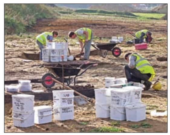
Soil-sampling for environmental and possibly industrial remains.

The quarry lies within the broad plain of the river Blackwater, and the present valley was created, and became greatly diminished in size, when its headwaters were captured by the River Wey around 50,000 years ago (Wymer 1987, 17). This left a wide valley that was not prone to flooding, and suitable, therefore, for occupation ( cf Poulton 2004, 58). The 2009 excavation site lay along the edge of the floodplain, on sandy clays with gravel deposits and chalk flecks that reflect the variable geology of the surrounding area.