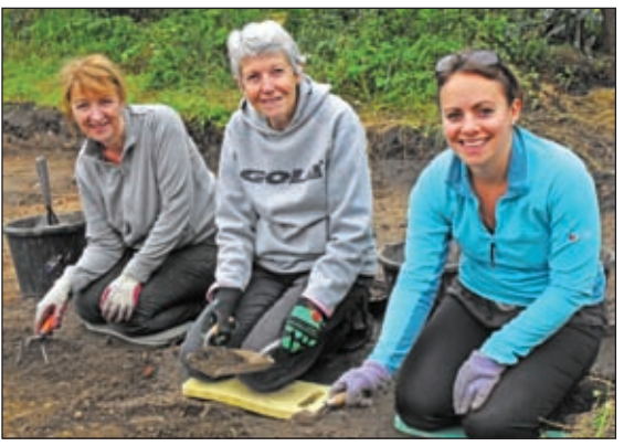
Some of last years volunteers.

Dig for a Day sessions will take place on 14th, 15th, 16th, 21st, 22nd, 23rd and 28th September. The weekend days of 15th and 16th September and 22nd and 23rd are reserved in the first instance for those who work Monday to Friday.