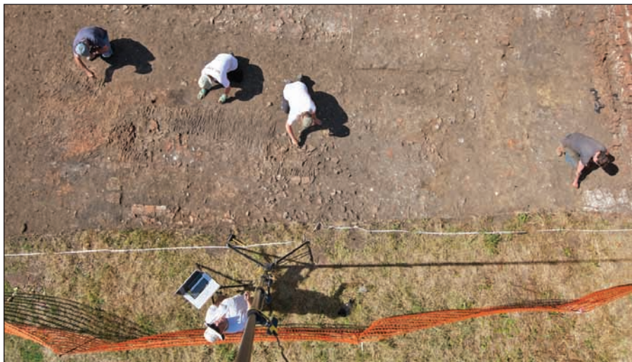
Fig 6 Woking Palace 2010: Overhead view of tile-on-edge hearths in trench 10 being cleaned.

laboured hard and skillfully through the cold, wet, wind and occasionally heat of a typical summer. They all deserve enormous thanks, and the following may be mentioned specifically. Thanks are due to Woking Borough Council, the owners of the land; to the Department of Culture, Media and Sport (acting on the advice of English Heritage) for granting consent for work involving a Scheduled Ancient Monument (No 12752), and to those who took the lead roles in organizing and assisting the excavation work: most particularly Richard Savage of the Surrey Archaeological Society; Abby Guinness (the Community Archaeologist, supported by the Heritage Lottery Fund) of the Surrey County Archaeological Unit; Joe Flatman, County Archaeologist; and the Friends of Woking Palace for refreshments and much else. The technical expertise and assistance provided by Archaeology South-East (University of London), QUEST (Quaternary Scientific, University of Reading), and Surrey Archaeological Society was also hugely important.