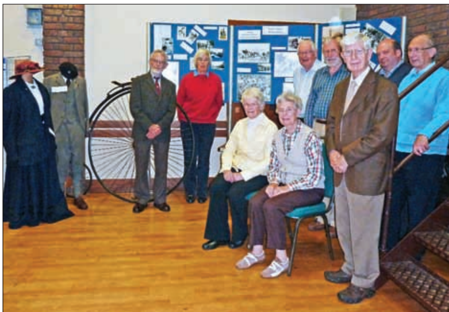
Members from History Society Send and Ripley, Woking History Society, Sunbury & Shepperton History Society, and Walton & Weybridge History Society.