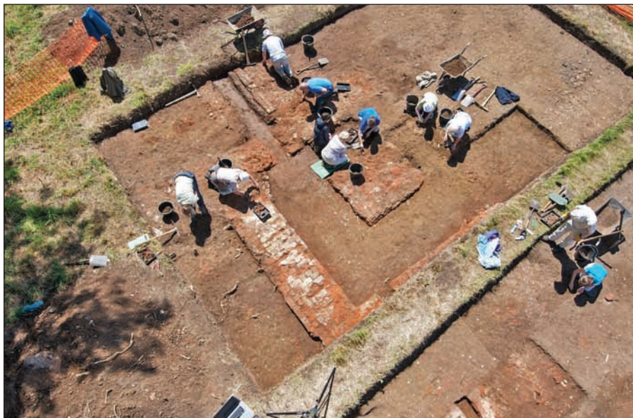
Fig 4 Woking Palace 2010: Tudor brick walls under excavation, with square core (newel) of the staircase visible.

A key part of the project was giving members of the public a chance to become involved in the excavations. In all some 155 adults and 140 children and young people with little or no previous experience were able to have their first taste of life in an archaeological trench and to experience at first hand the processes through which evidence of the past is obtained from the soil. Also of general interest may be that a film crew from 360° Productions were on site for two days filming for a programme commissioned by BBC 2 in their "Digging for Britain" series for screening in 2011.