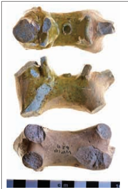
Fig 5 Woking Palace 2010: A ceramic toy horse of later medieval date.

The excavation was only possible as a result of the efforts of a large number of organizations and individuals, who