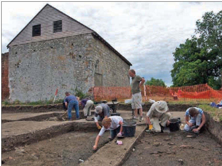
Fig 3 Woking Palace 2010: Excavation of the midden area in trench 6, behind (west of) the late 15th century stone building.

These latter areas formed two of the principal foci of the 2010 excavation (fig 2). The kitchen refuse in trench 6 (fig 3) revealed substantial amounts of animal bone and pottery which showed that it was being deposited in the late 13th or early 14th century. The bone includes foods only eaten by people of high status, including deer, wild birds, and lamb. This important collection is to be studied at the University of Nottingham. The refuse was sealed and preserved below the floors of a new range of stone buildings, erected around 1300, that seem likely to have been part of the privy lodgings (frontispiece). A few metres to the north, in trench 10, a number of hearths were identified. They were constructed using roof tiles laid on edge (fig 6) and undoubtedly belonged to the principal manorial kitchen, and seem to have been taken out of use around 1500. It is uncertain how early they were in existence.