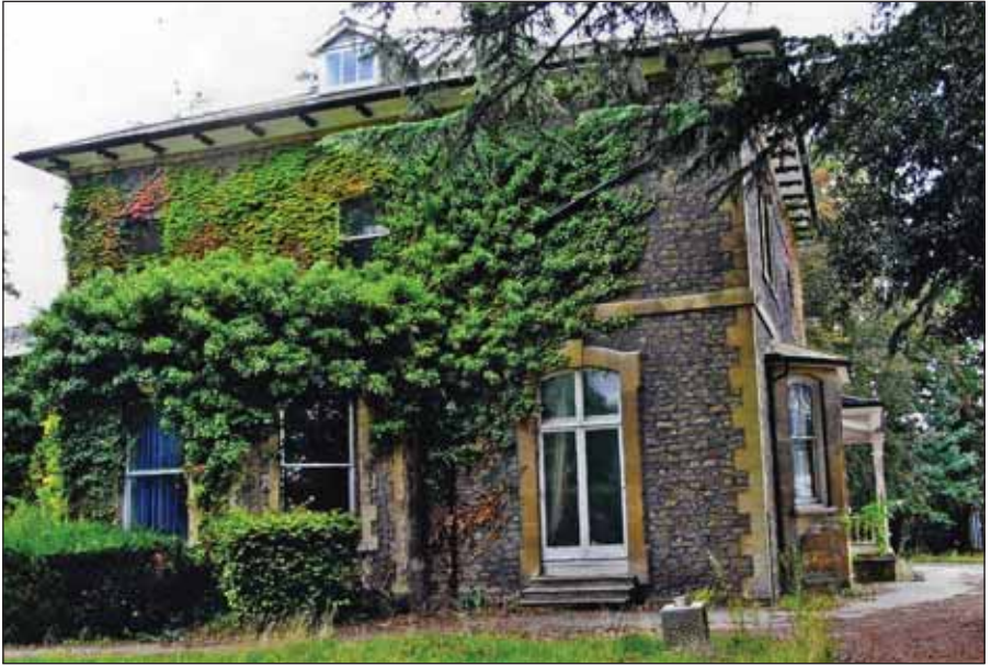
'Uplands', Merrow, Guildford.

interest among local residents when the site was sold for development in 2008. Linden Homes South West plan to build some two hundred homes on the site and to refurbish 'Uplands' to provide quality apartments. The house is currently in a state of dire dilapidation. The house kindled my interest too, because of its association with General Pitt Rivers, then Lane Fox.