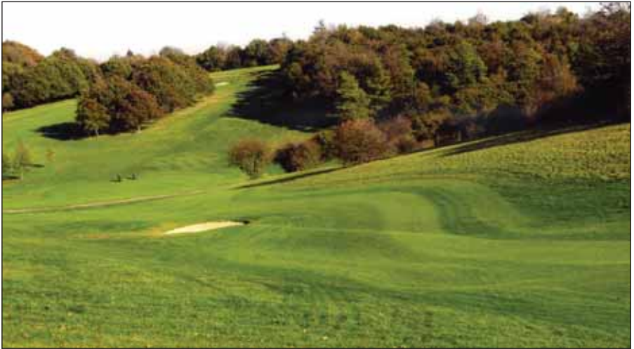
Presumed site of Bronze Age barrow excavated by Pitt Rivers on Merrow Downs (now Guildford Golf Course), to right of 2nd green in the distance and just behind second clump of trees to right.

A Bronze Age barrow was excavated on Merrow Downs by Pitt Rivers in 1877, which was briefly recorded and believed to have been to the south-east of Levylsdene and nearby Keeper's Cottage in Walnut Tree Bottom. This barrow 'contained a British urn' and may have been a short distance down the slope from what is now the second green on Guildford Golf Course (see figure).