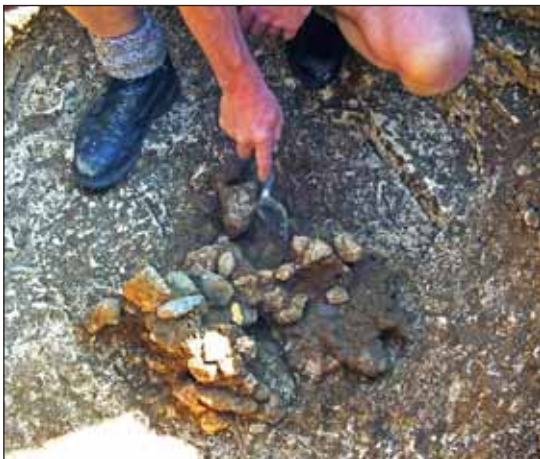
'Cairn' at base of Shaft 1005.

The second quarry [2006] appears to represent a continuation of [1033] and had two phases of exploitation separated by a lense of compacted chalk backfill [2005]. The latter sealed a placed deposit comprising a complete cattle skull (minus horncores) which had been propped up on a platform of fist-sized flint nodules. A further possible quarry [2026] was identified in the NW corner of the trench.