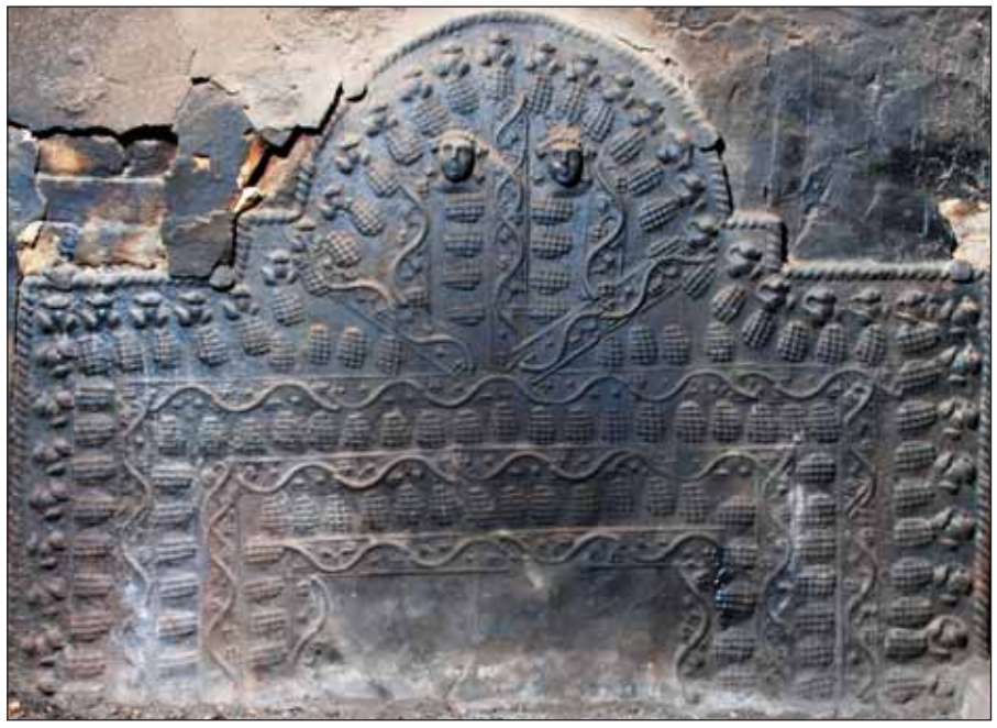
A 16th century Wealden Fireback at Grayswood, Surrey

Studies on the subject have been written in Germany, France, Norway and even America, but not in Britain.