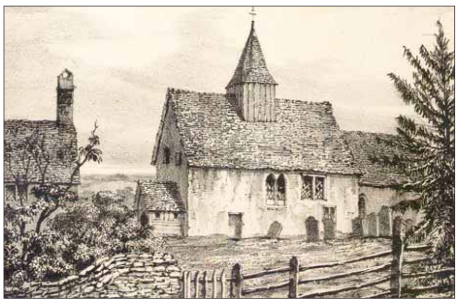
Drawing of St Peters Church, Hambledon by Cracklow in 1824