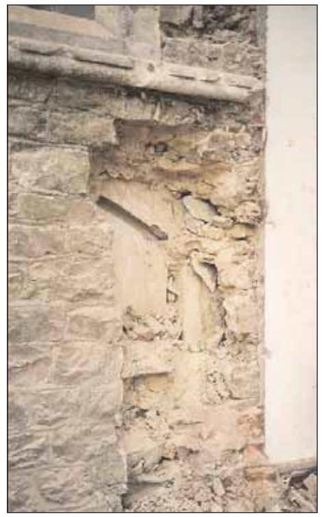
Hambledon Church. Exposure of north chancel wall

The result was inconclusive and the number of finds recovered was small: those from Trench I included Bargate and Horsham Stone building material, including one virtually complete Horsham Stone roofing tile, which do not relate to the existing building. It is probable therefore that the foundations of the medieval north chapel lie under the north aisle of the present church.