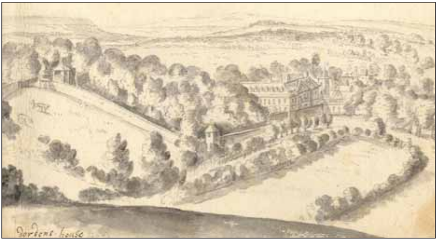
Durdans: Lord Berkeley's house of the 1680s.

These days the sudden untimely death of a prince who was hated by the establishment but sufficiently popular to be known as the people's prince would give rise to endless conspiracy theories.