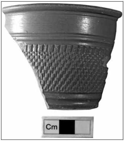
ASHTEAD ROMAN VILLA: Fragment of samian cup of form Dr. 30R

The foundations were made by digging trenches into the clay and packing them with flints, roughly coursed. The walls above foundation level were also entirely of flint, except for the tile-reinforced corner, already described. In excavation the wall lines were seen before walls as such were found, which suggests that Lowther found the walls in some way and left an un-dug piece of site debris above them, as though each room was a trench and the walls were the berms. The wall between rooms 10 and 12 refused to turn into a 'proper' wall until foundation level, but there was so much debris along the line that the most reasonable explanation is that it was treated as a 'wall' by Lowther but was in fact a robber trench which was left standing as an island. A mortared floor level was found in room 11 but the others had only a disturbed sticky grey layer over the natural, most probably a mixture of trample in the