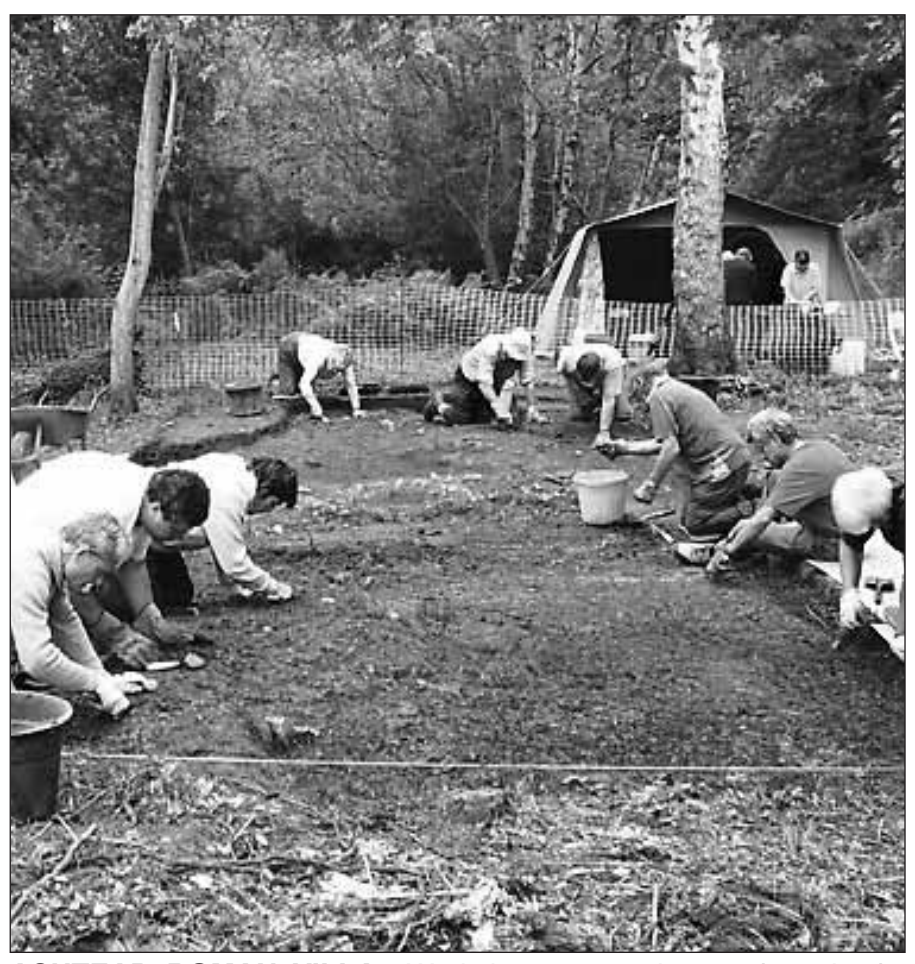
ASHTEAD ROMAN VILLA: Work in progress in trench 3: in the foreground is the corridor floor of crushed brick; beyond that the dark line marks the location of the front wall and the gutter; beyond that again is the area of debris thought to be the result of Roman (or later) robbing of the site.