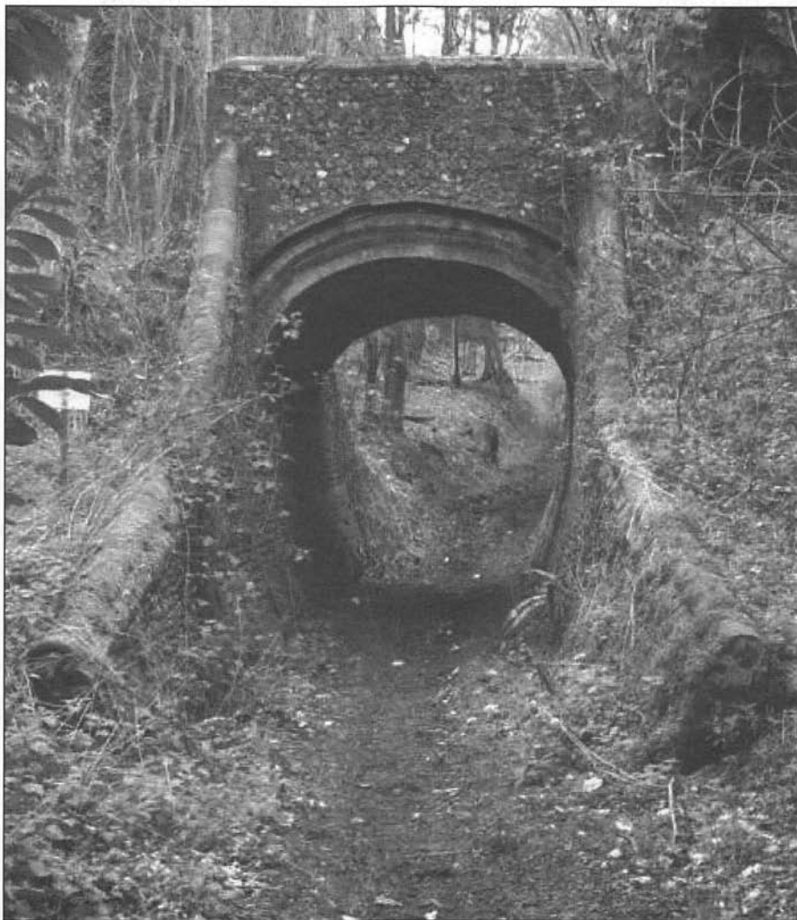
THE BRIDGES OF LORD LOVELACE Raven Arch: one of the smallest (see p. 5)