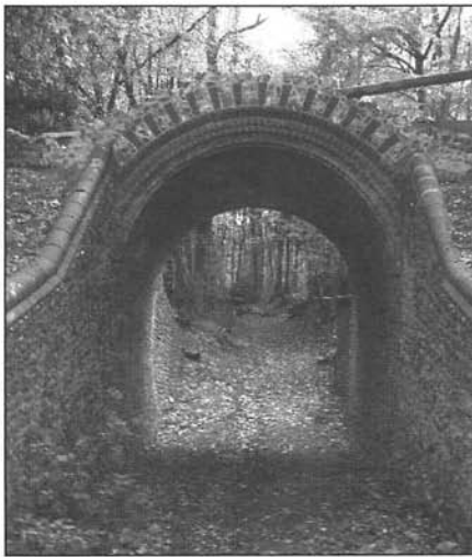
STONE DENE BRIDGE