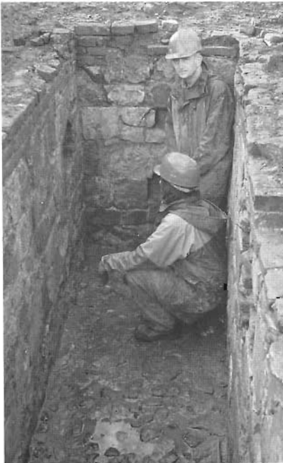
Final cleaning of the Sawpit.

I am very grateful to all those who helped on the site and who worked through truly appalling conditions. On most mornings we needed a water pump to empty what initially looked like a narrow rectangular swimming pool rather than a sawpit. As mentioned above, the pit has now been backfilled and covered over and will be preserved under the new cricket club extension. Perhaps at some future point enough money will be found to allow the structure to be lifted and put on display at Tilford – until then it remains safe underground.