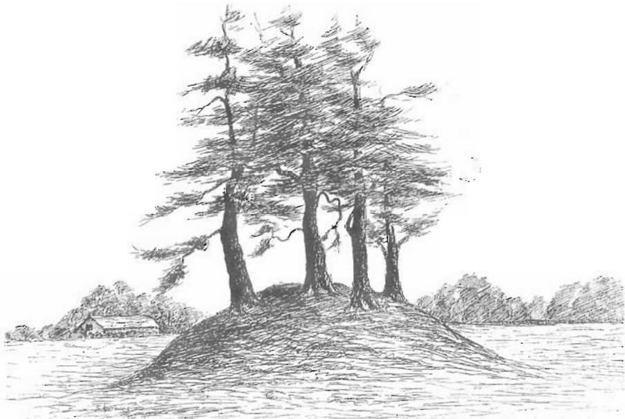
Tumble Beacon Round Barrow, Banstead; frontispiece to Neolithic Man in North-East Surrey.

I am particularly fond of this book as it was instrumental in starting my interest in archaeology, having been lent to me when I was secretary of a local history society, and formed the starting point for my A-level archaeology project. [The frontispiece is an engraving of the Tumble Beacon round barrow in Banstead, and I went on to discover numerous flint tools from a neighbouring garden, and ultimately, while still an A-level student, getting permission from English Heritage to direct an excavation of the barrow (a Scheduled Ancient Monument) and dig a trench in a neighbouring garden to look for a ring-ditch]. This was partly motivated by searching for a Neolithic 'working camp' described in the book supposedly 'not far distant' from the Tumble Beacon, and led on to the Plateau Group's excavation nearby which has recovered several thousand worked flints from a 10m by 10m trench. Interestingly, a few years