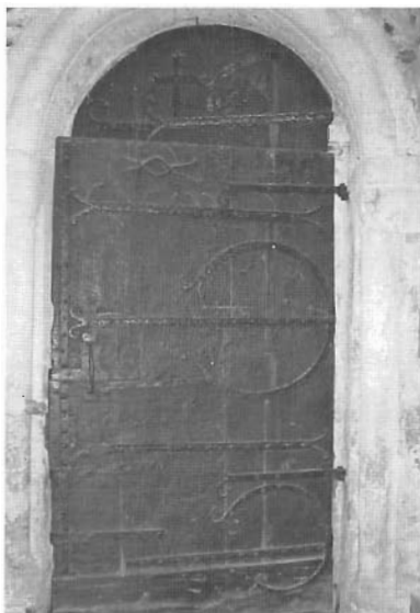
St. Peter's Church door.