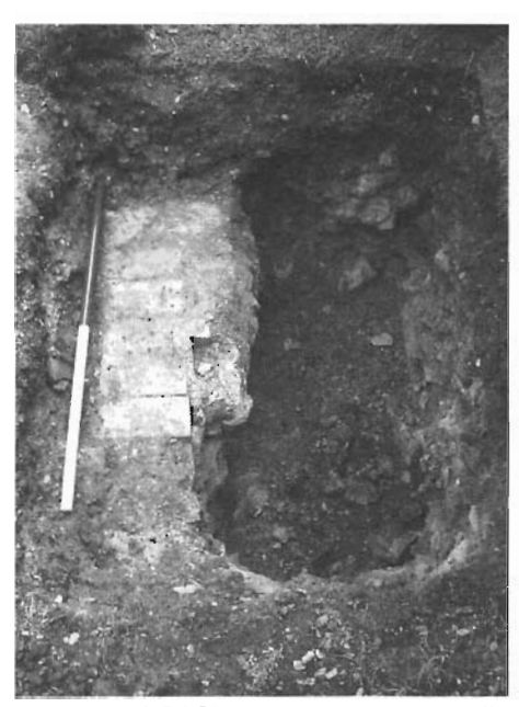
FARNHAM CASTLE: Earlier terrace wall

the late 17th or 18th centuries seems not unreasonable as a best guess. What seems almost certain is that the buried wall represents the remains of an earlier retaining wall left 'fossilised' to the rear when the present terrace wall was constructed. An engraving of 1830 shows the south front of the castle with a southern terrace wall, which is obviously different from the present one, and it may be that this is what was exposed in two of the three trenches.