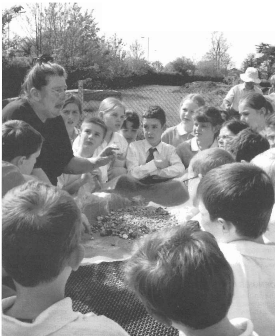
HATCH FURLONG, EWELL What we find in wet-sieving (see p.16)