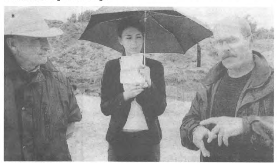
That's me, the site director, under interrogation from the Surrey Mirror reporters