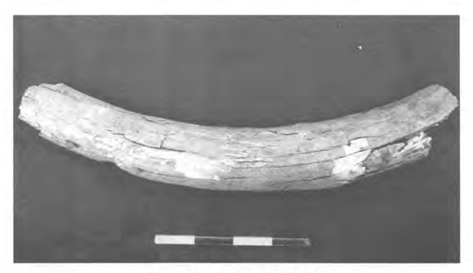
Mammoth tusk from Badshot Lea

Finds of mammoth tusks, teeth and bones, and the teeth of woolly rhino and of other extinct species that bear witness to a cold climate are, or were, quite common from the river gravels of Terrace D, one of a series of terraces long recognised in this part of the Wey valley. These gravels survive in parallel strips lying either side of the River Wey and form the ground on which Farnham is built to the north of the river. The southern part of the terrace was extensively quarried in the late 19th and early 20th centuries when quantities of mammoth and woolly rhino remains were recovered and reported in the 1939 SyAS publication A Survey of the Prehistory of the Farnham District.