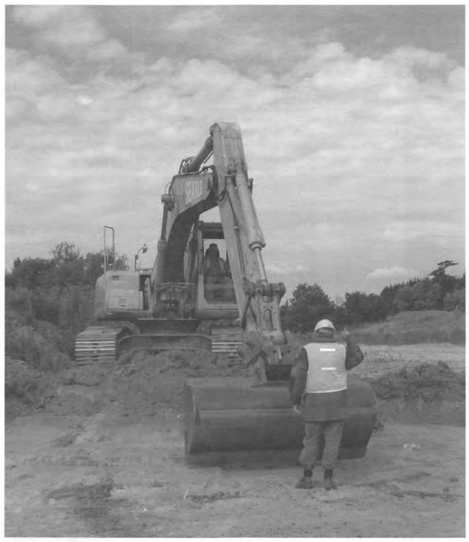
THE BIG BLETCHINGLEY STRIP