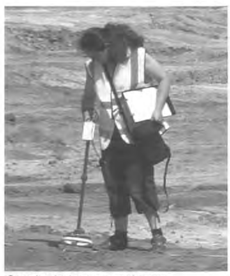
Geophysical survey underway

by another, on hire, who had not driven for some time and had no experience of archaeological requirements, We did what was possible, but the site still looked a mess. That's not to say that it had been easy to do, however, since it meant stripping baked ploughsoils from loose sands around the fringes of the hollow, and, at least in the first day of work, an attempt that proved impossible to perform, to peel off the ploughsoils to within 5cm or less from the underlying 'dark deposits' This was one of the stipulations for the efficacy of one or more of the geophysical surveys being undertaken. although no serious suggestions as to how this could ever have been possible were made. Another requirement of the geofizz bods, and one that will become an increasing irritatant, is that, because no substantial metal was allowed within 30m of the