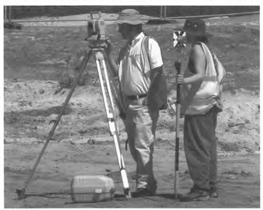
MOLAS staff surveying the site

The first three weeks of work involved the stripping of up to almost a metre of ploughsoils, both ancient and modern, from a series of 'dark deposits', which required a big machine and a big dumper. The Del-boy digger of the first day was sacked on the second, and the quarry company's excellent stand-in for two days was replaced