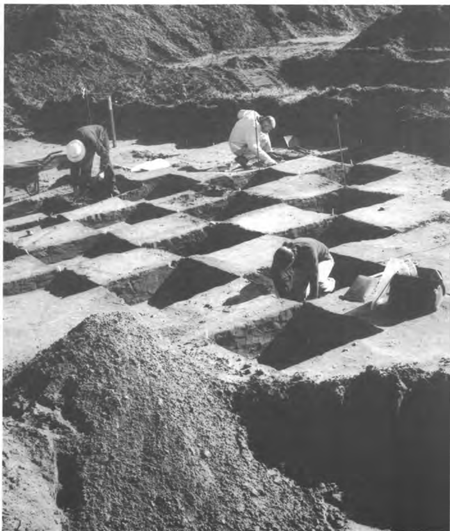
SCAU excavating a Late Glacial site near Weybridge.