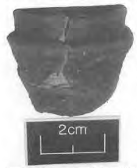
Frensham Common: one of the miniature Roman pots.

We have since carried out a series of small excavations designed to establish the nature and extent of the coin deposit, and are now in a position to say that it was