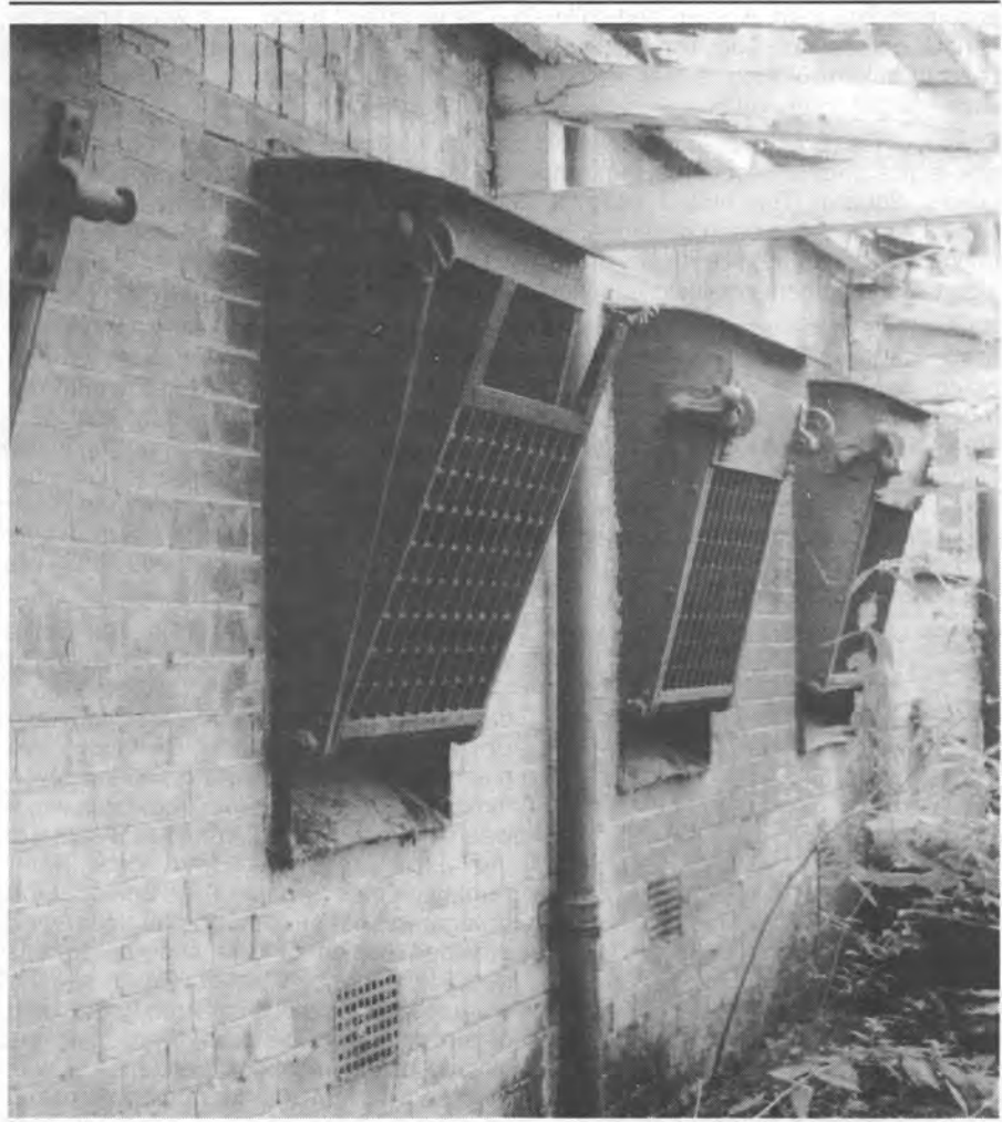
It's 1907, and you're down on your luck in the Guildford Workhouse Vagrants' Ward. Your hatch opens, rocks are poured in, and you must crush them small enough to push back through the grill. Otherwise, there'll be no gruel for you.