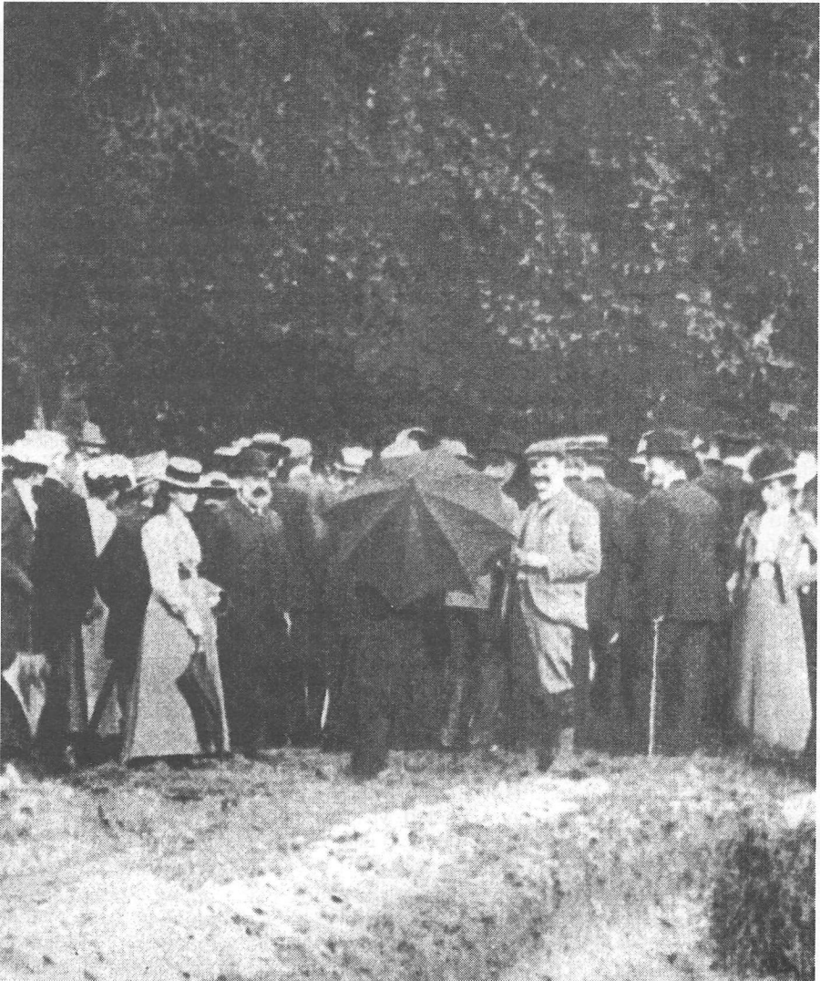
The Society at Waverley 100 years ago.