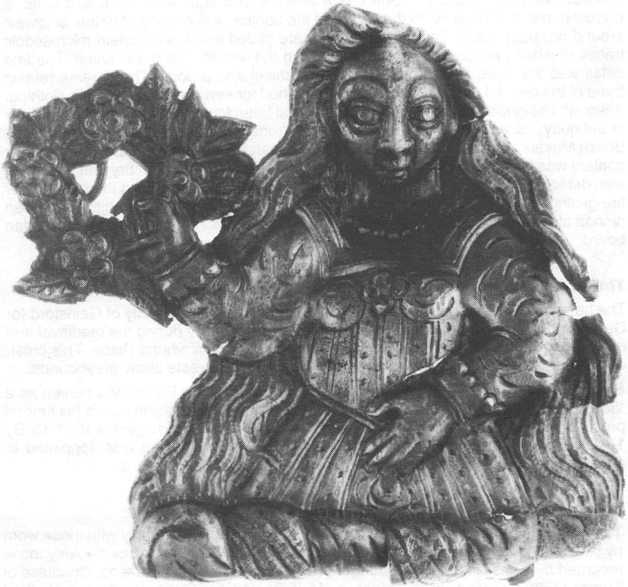
The Livery Badge from Chelsham (above) and the Farnham Pin (inside)