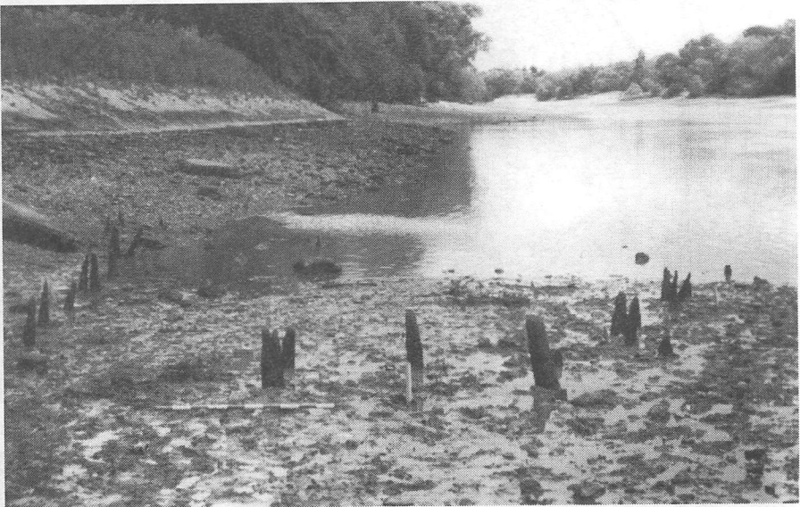
Mid Saxon Fish Traps, Chelsea (top) and Isleworth (bottom).