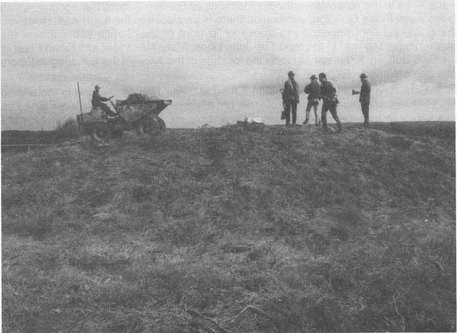
National Trust volunteers about to start work on one of the barrow mounds

The result of all this work is that the barrows are now, once again, visible from nearly the whole area of the common and, perhaps more importantly, any intact stratigraphy is safe for a few more years. It is to be hoped that similar projects can be initiated where necessary in other parts of the county.