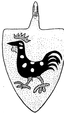
Medieval harness pendant from Leatherhead. Scale 1:1.

whose members occasionally stray across the border into Surrey, and the Weald and Downland Detector Club which meets on the first Monday of each month at the Greyhound in Brighton Road, Redhill. The W & D Club is a recent formation whose activities are at present hampered by a lack of available land on which they may detect as a group. Permission for the Club to detect on land at Chelsham has recently been withdrawn leading members to suspect that the Treasure Act was somehow responsible. Enquiries soon revealed that neither the Treasure Act nor any misbehaviour by the detectorists was responsible; the tenant had simply just become aware that the landowner's policy was not to allow detecting. This lack of opportunity to detect is, in many ways, a pity as the potential gain in information from the continual recording of finds from a concentrated area can be considerable. It is to be hoped that a more relaxed attitude by landowners (for instance stipulating that finds from their land must be recorded) can be achieved coincident with the co-operative spirit already largely present from the detectorists themselves.