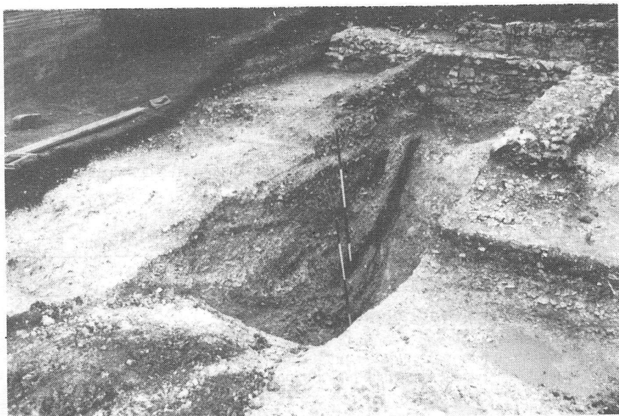
b) A section through the Bailey Ditch (ranging poles in half metre divisions), with 13th century walls on its northern edge.

The so-called "wine-cellar" discovered in 1993 was examined nearer to the Castle Arch. The remains of further walls were identified, parts of which had the appearance of collapsed vaulting. The surviving archaeology was, however, at a very considerable depth and, for this reason, it did not prove possible to complete the investigation. The results are, therefore, somewhat inconclusive, although it is clear that there is substantial evidence for an early 13th century building here. For this reason, Guildford Borough Council have agreed to fund further investigation of this feature; because of its complexity and the small area, it will not be possible to do this as a training excavation.