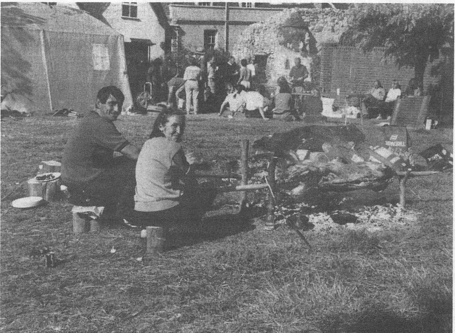
At the barbecue on the final day two sheep are roasted in the traditional manner by refugees from Bosnia, now living in Surrey