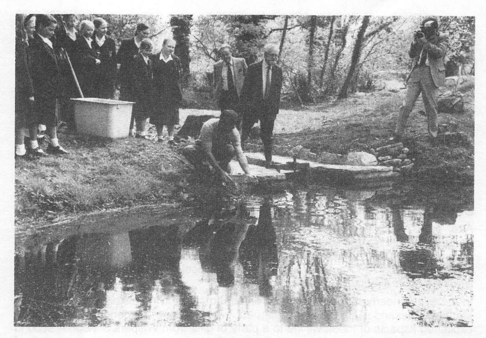
Carp being released into the moat, watched by some of the guests