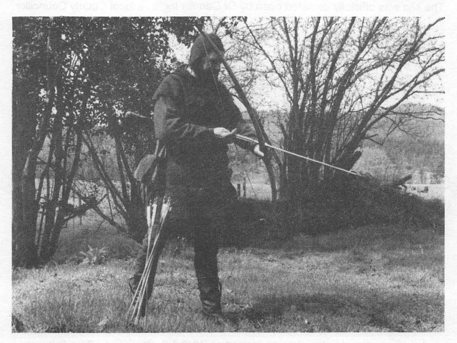
A demonstration of medieval archery