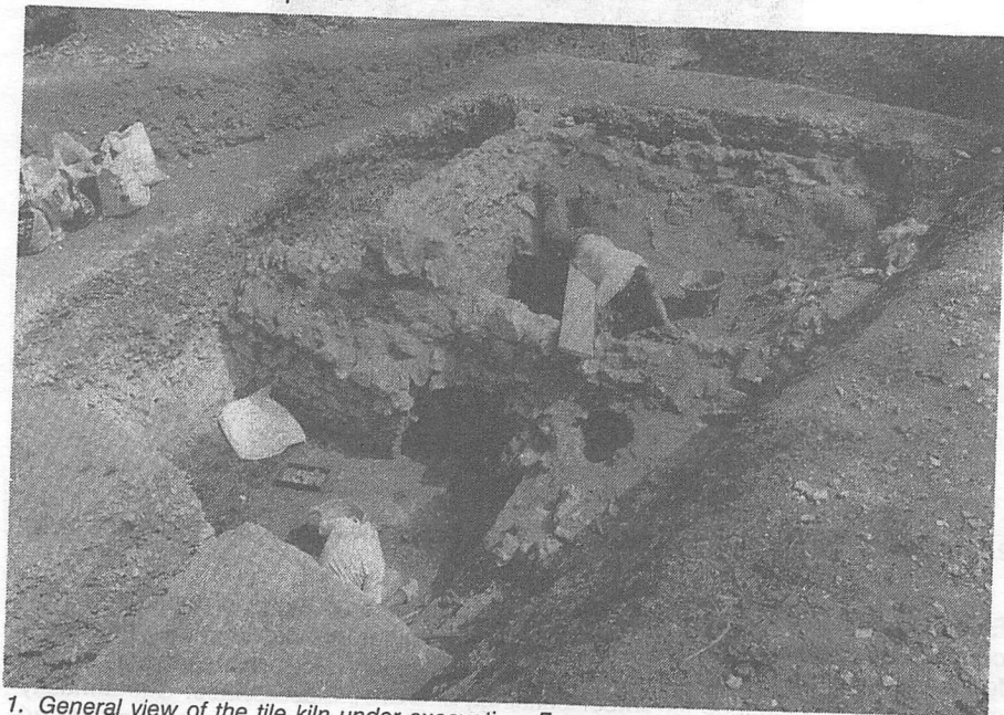
1. General view of the tile kiln under excavation. Foreground: stoke pit, partially excavated. centre: the fire box arch and the kiln proper under excavation.

The second season of excavations on the presumed site of the Royal Palace at Guildford Castle took place in July 1991, and was, again, a considerable success. Many of those who had worked on the site in 1990 returned, and provided a nucleus of skill and experience which eased considerably the process of assimilating the many new diggers into the team. The site aroused considerable public interest, which the volunteer guides worked hard to satisfy. The archaeological results, building on those achieved in 1990, lent themselves to explanation to and appreciation by visitors, and serious consideration is being given to the possibility of permanent exhibition of some aspects.