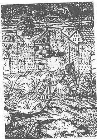
The Central panel before restoration.

In May 1987 a workman, called in to repair faulty woodwork, noticed some painted decoration in a corner of the room in which he was working. A wall panel was carefully removed and was found to conceal a wall-painting of about 1570-80. The wall, about five metres in length, is divided into three sections. The panel on the left and some parts of the third one bear stylised foliate decoration in black on a parchment-coloured ground, the centre one has the figure of a man in costume of the mid-Elizabethan period against a conventionally-treated background of castle walls and ramparts. He was thought to represent an apprentice as he carries a stave or 'waster' over one shoulder of the type allowed to those below the rank of gentlemen who were forbidden to wear swords. A small shield or buckler depends from this. He has wide padded breeches, a small ruff, a flat-crowned hat with a plume and decorated shoes. Above each of these first two panels are two lines of doggerel verse of a didactic nature: