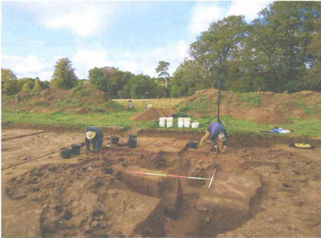
Excavating the 'Abinger Anomaly' – a remarkable Early Neolithic pit