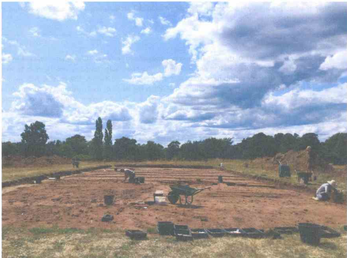
Excavating with social distancing under Covid-19 restrictions at Abinger in 2020