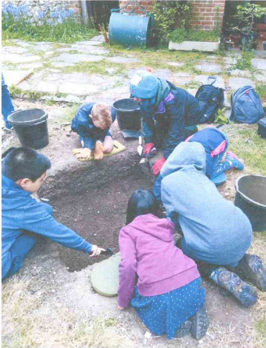
Test pitting at Rowhurst