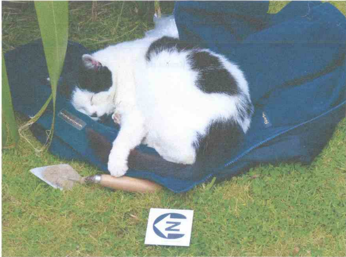
Test pitting at Rowhurst