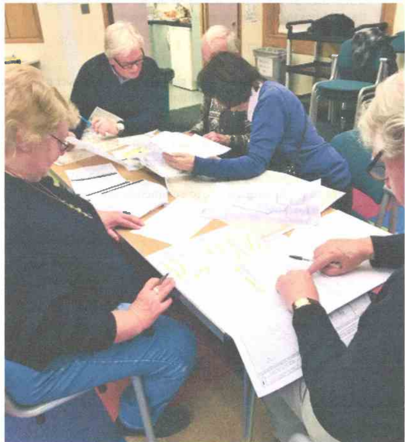
Training at Surrey History Centre