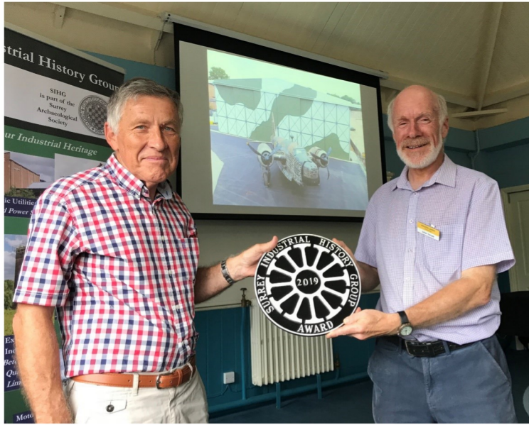
The 2019 Surrey Industrial History Group conservation award was presented to Brooklands Museum for the 'Brooklands Aircraft Factory', set up in the restored Bellman Hangar; see page 5.