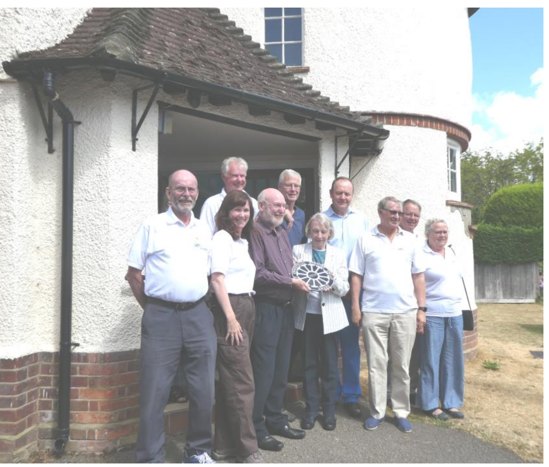
The presentation at Shere Village Hall and Museum. Saturday 28 July.